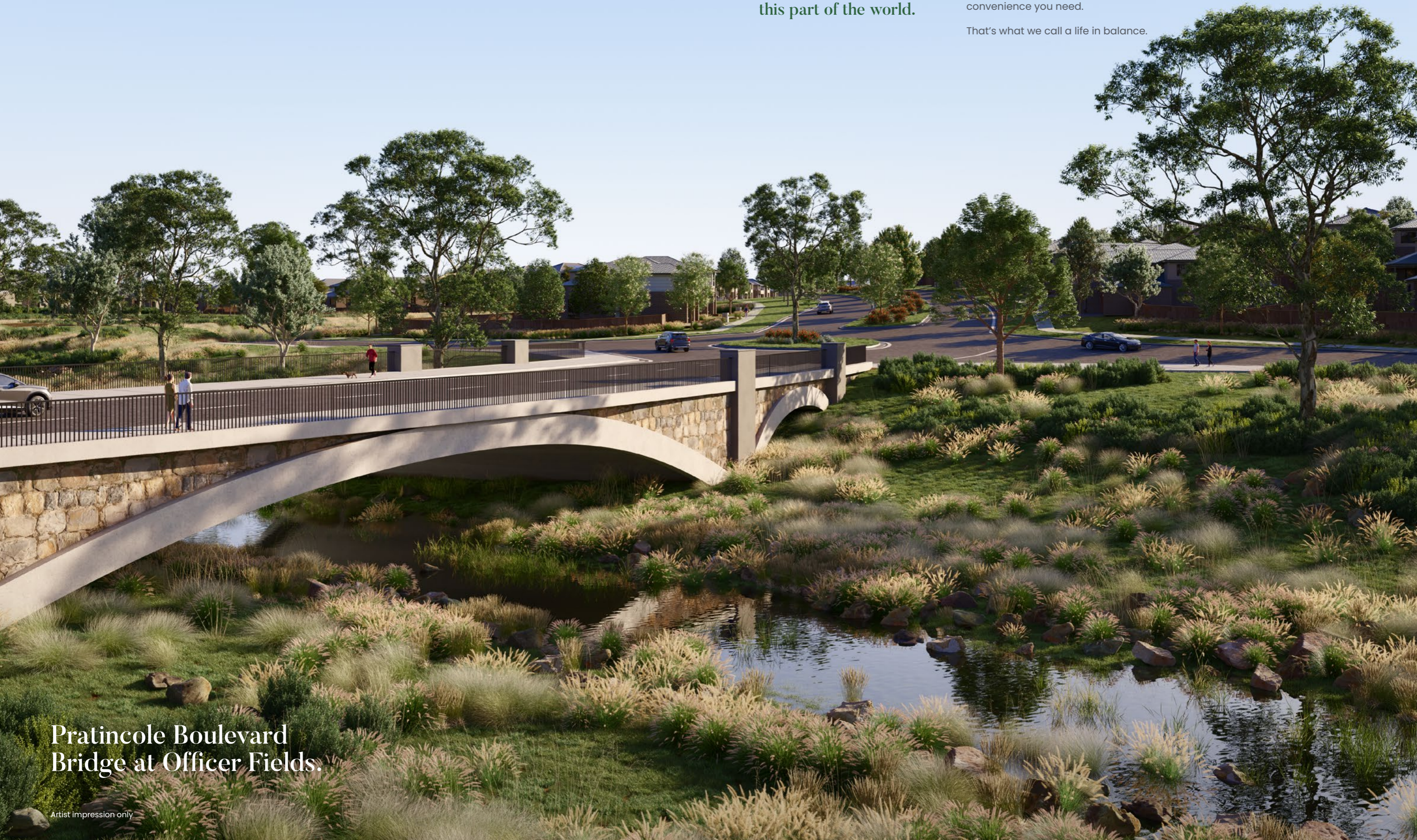
Pratincole Boulevard Bridge at Officer Fields.